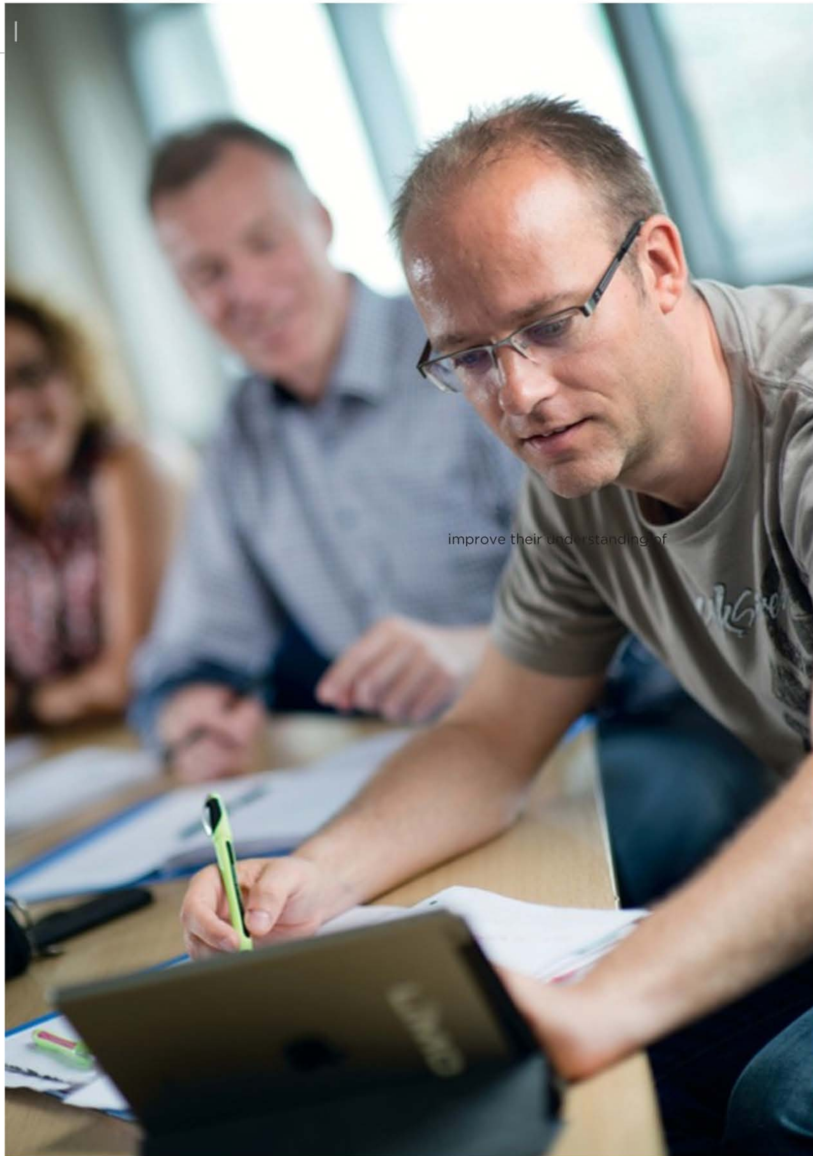
improve their understanding of